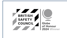
BW on white